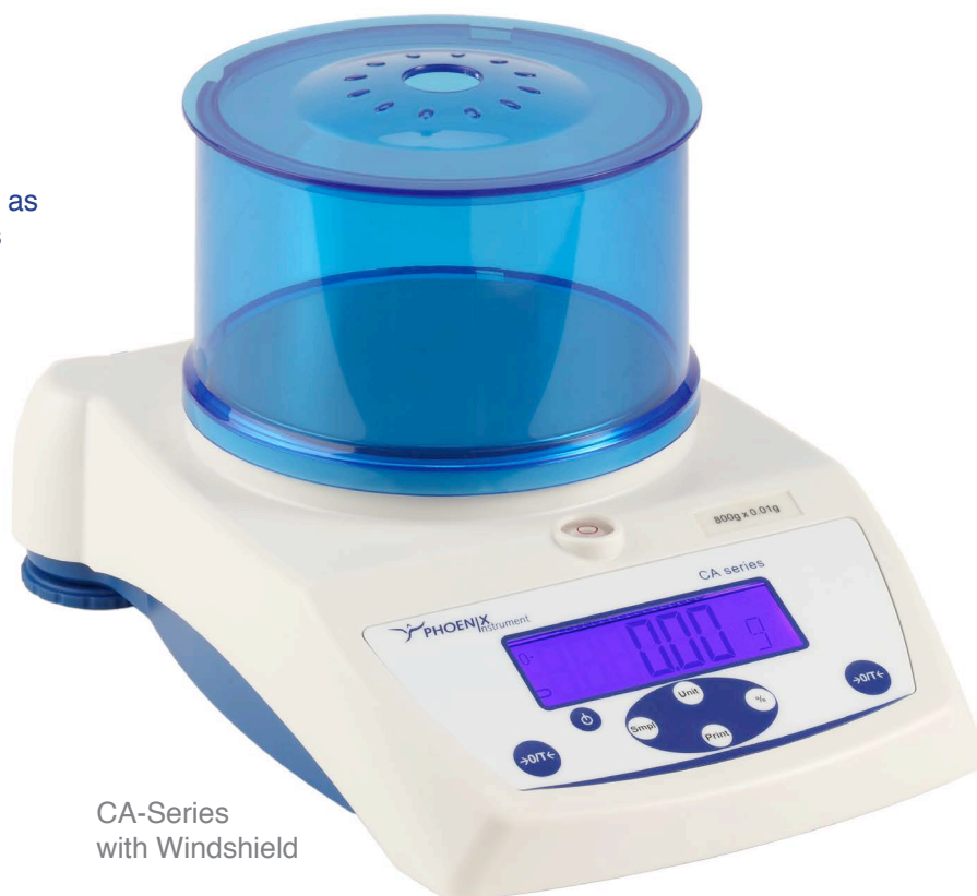
CA-Series with Windshield